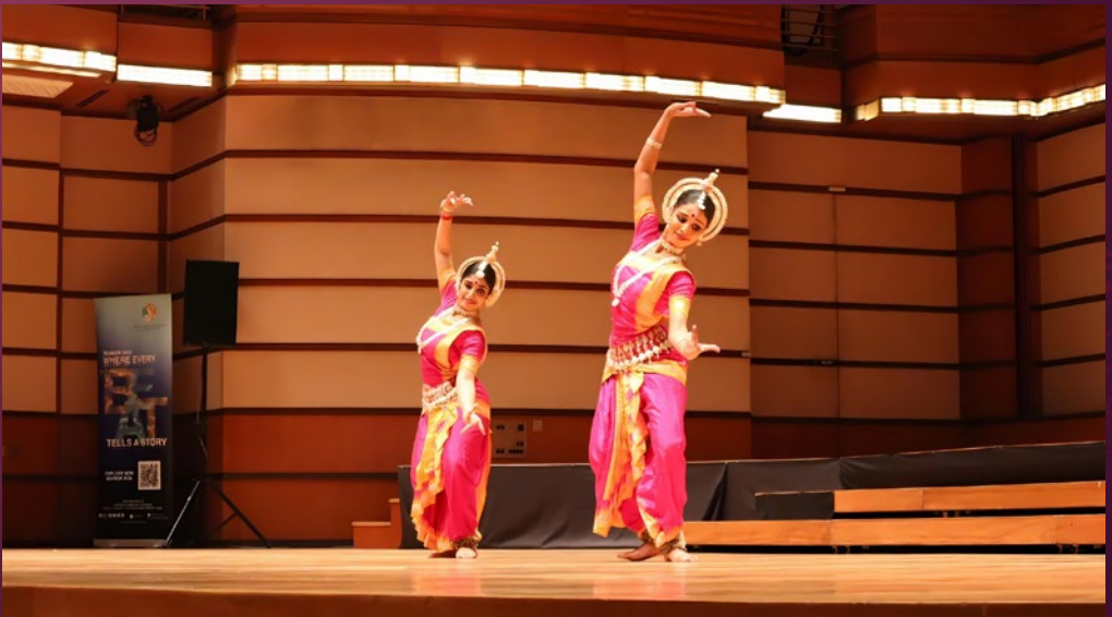
The media preview of Ragas And Mudras at DFP on 25 June 2025

This highly anticipated performance is an immersive journey into the heart of Indian classical music and dance. The audience will experience the soulful melodies of both Hindustani and Carnatic classical music, two distinct yet equally profound traditions of Indian music. The concert will feature intricate ragas and dynamic talas, brought to life by the accomplished musicians of the Temple of Fine Arts.