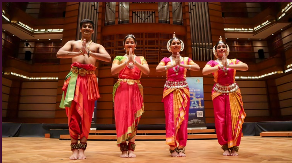
The media preview of Ragas And Mudras at DFP on 25 June 2025

Adding a vibrant visual dimension to the evening, the stage will come alive with exquisite presentations of four classical dance styles of India: