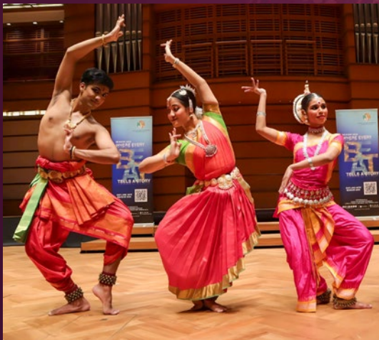
The media preview of Ragas And Mudras at DFP on 25 June 2025

TFA's teachers are presently teaching Bharathanatyam, sitar and tabla at Akademi Seni Budaya dan Warisan Kebangsaan (ASWARA), the Cultural University of the Government.